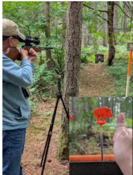
Arguably the hardest lane for every shooter – off-hand at 15 yard targets.