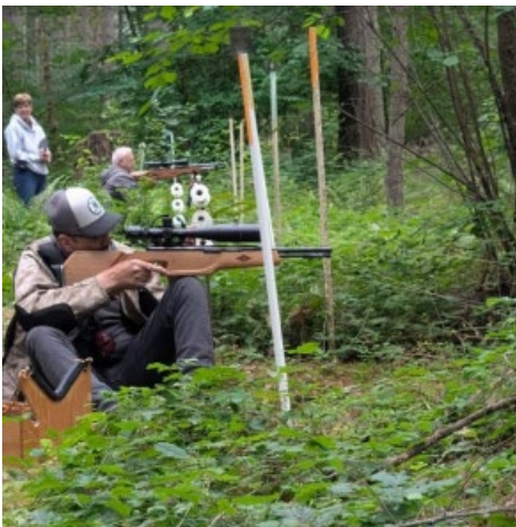
This shooter uses his left knee to support his rifle.